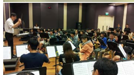
Sample of National University of Singapore

Donation Amount: HK$5 million or above Location: Ground Floor Area: 2300 square feet