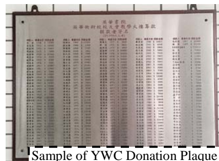
Sample of YWC Donation Plaque

Donation Amount: HK$5,000 or above Location: Dedication Wall of the Sports and Music Complex