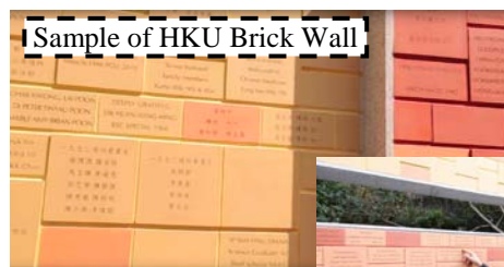
Sample of HKU Brick Wall

Location: 3 categories in different ways of presentation on Dedication Wall of the Sports and Music Complex